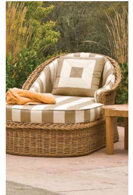
Chaise Lounge, Natural resin