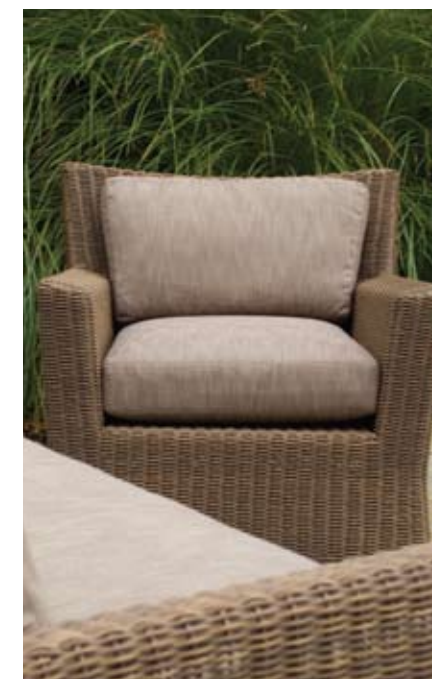
Belize Lounge Chair, Coco resin