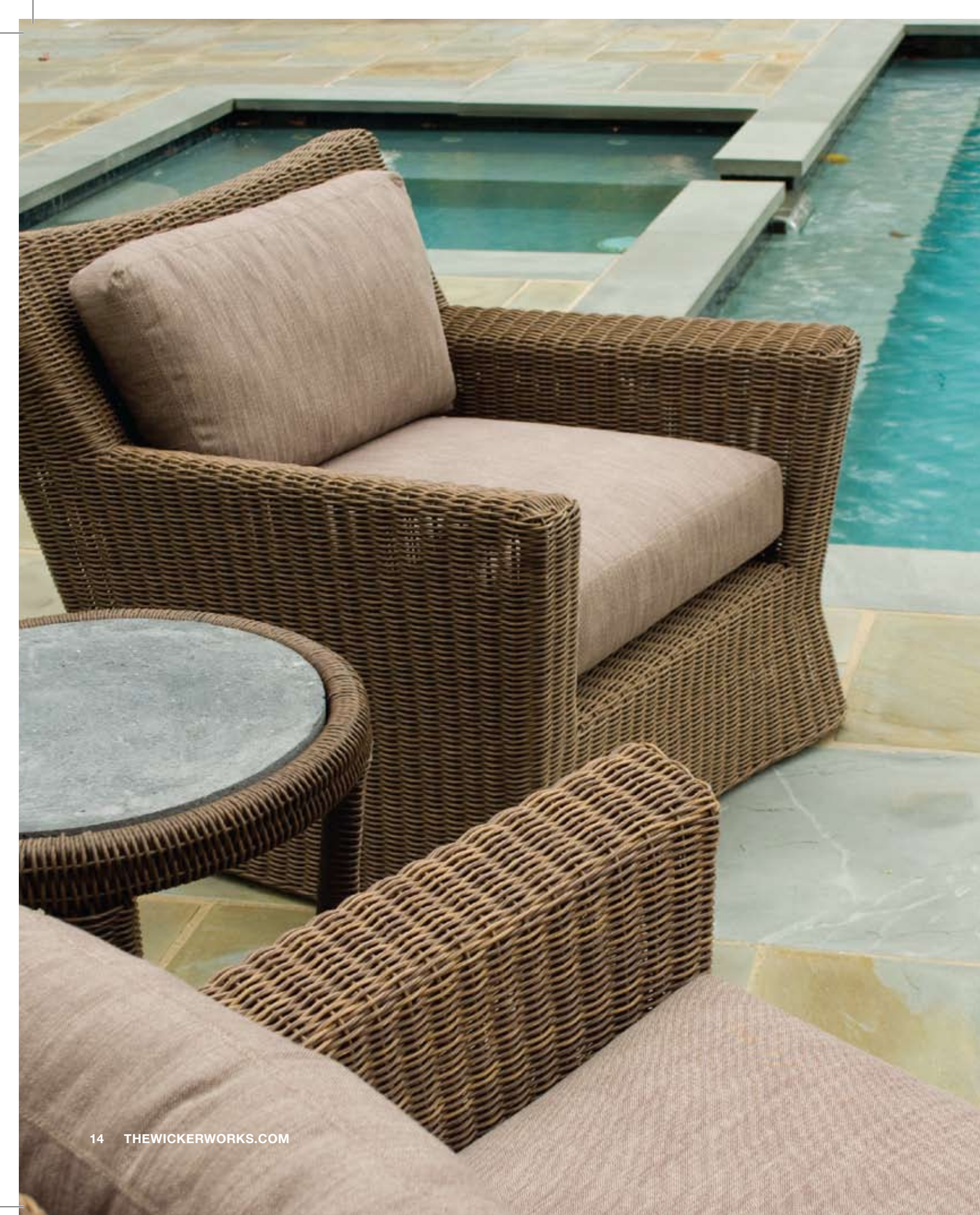
Belize Lounge chair, Coco resin