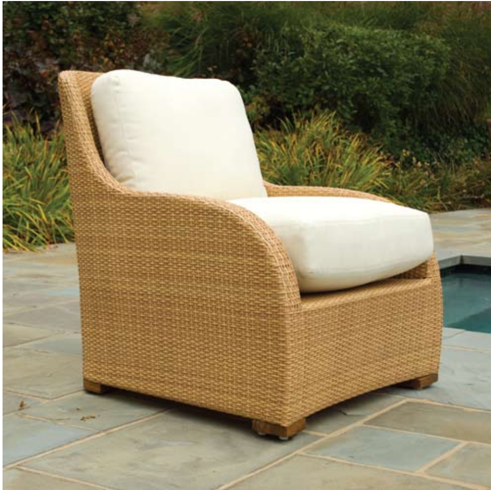
Brasilia Lounge Chair, Flat Weave Natural resin