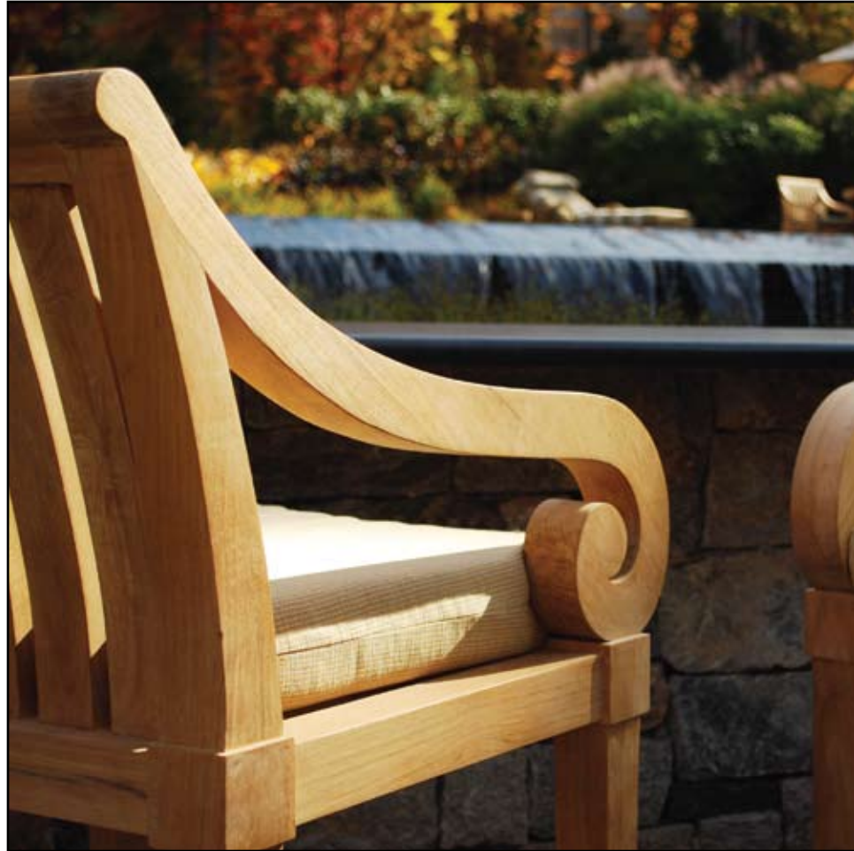
San Pietro Dining Arm Chair, Teak