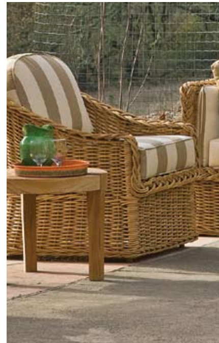
Round Back Lounge Chair, Natural resin