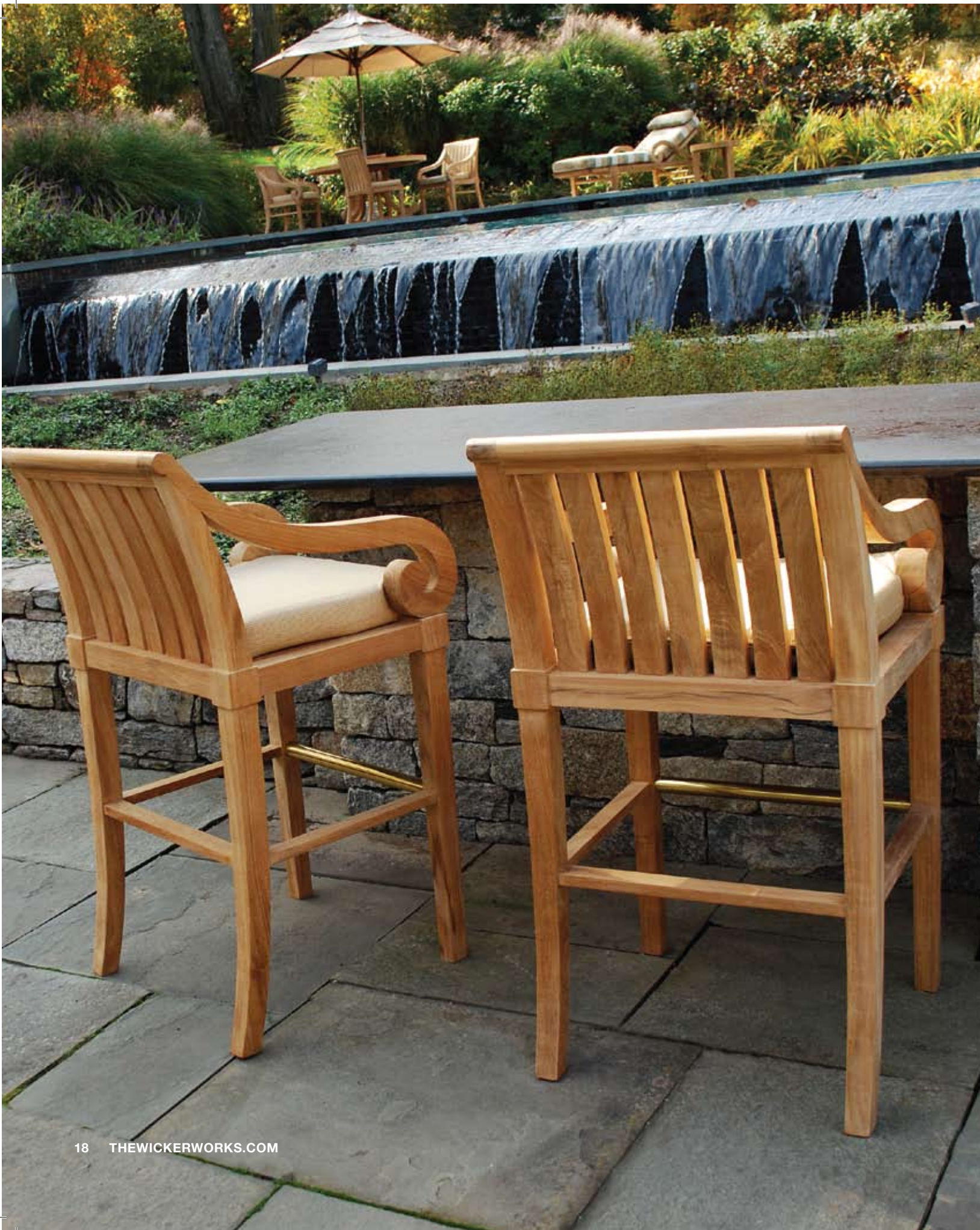
San Pietro Bar Stools, Teak