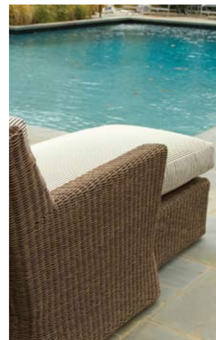
Belize Chaise Lounge, Coco resin