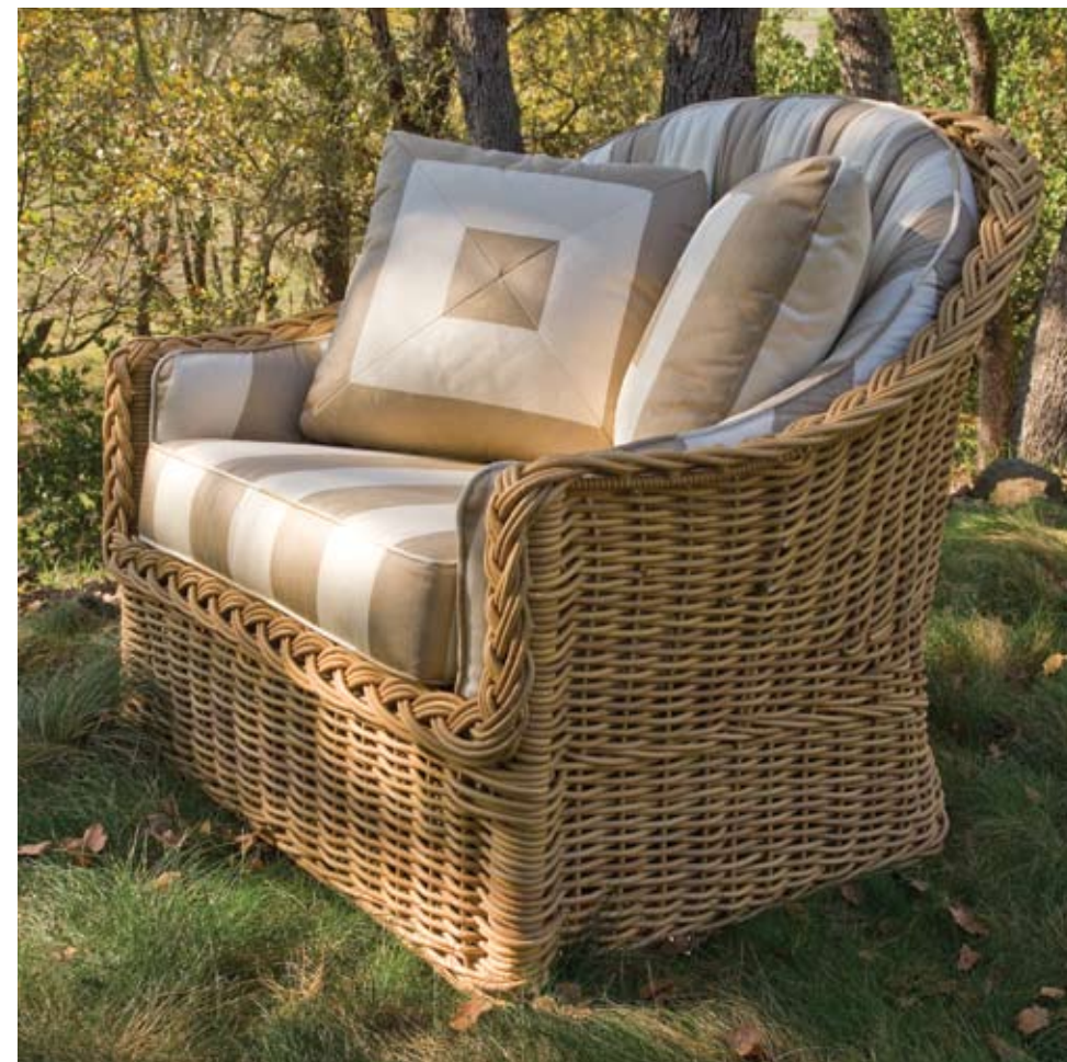
Large Scale Lounge Chair, Natural resin