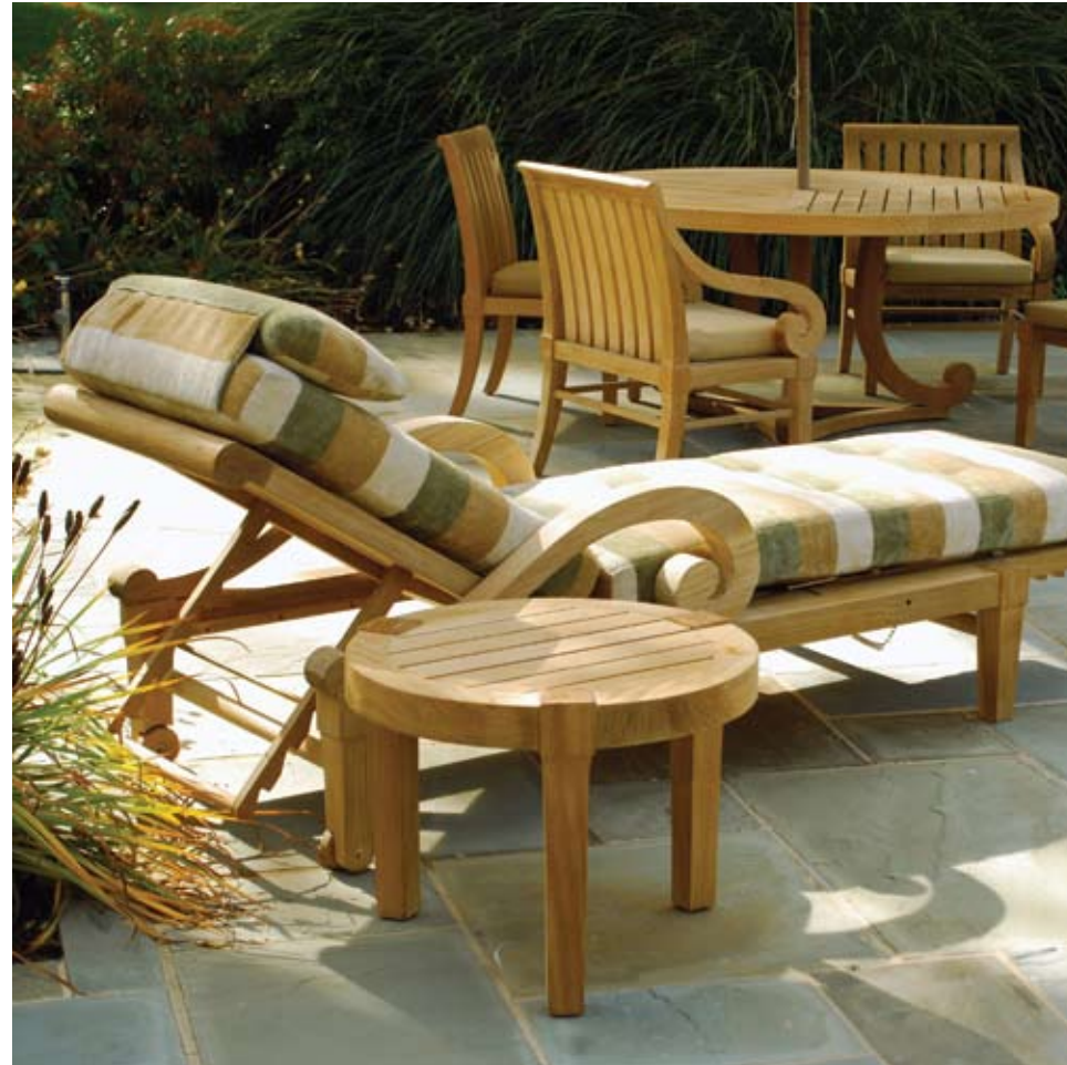
San Pietro Round End Table, Teak San Pietro Sun Chaise, Teak