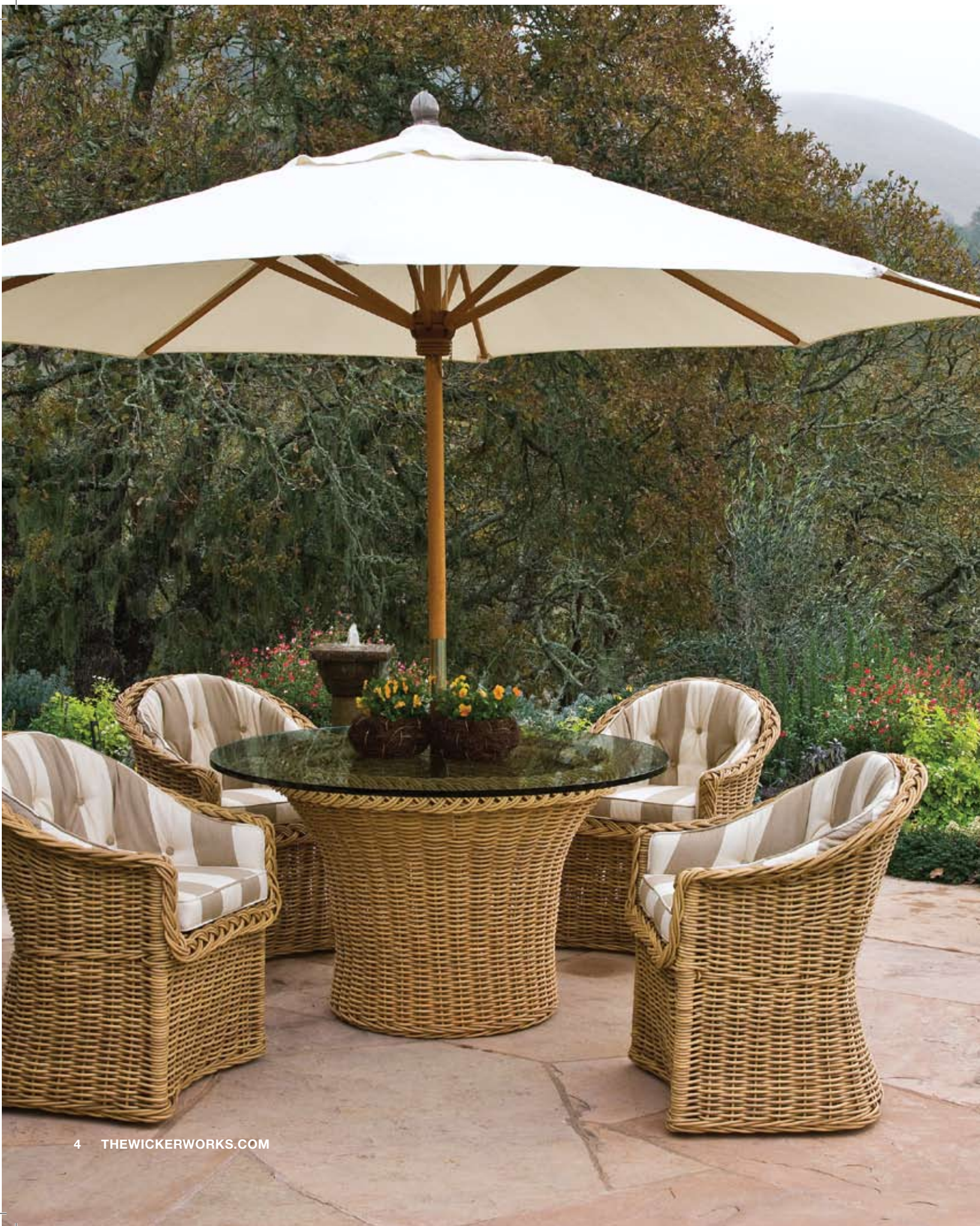
Bowed Front Dining Chairs, Natural resin Round Dining Table Base, Natural resin