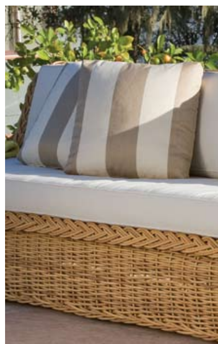
Armless Sofa, Natural resin