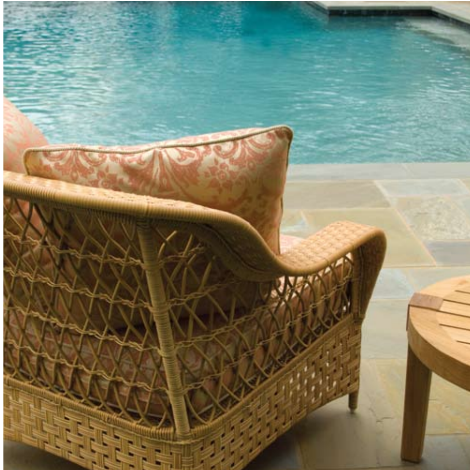
Brighton Lounge Chair, Natural Resin