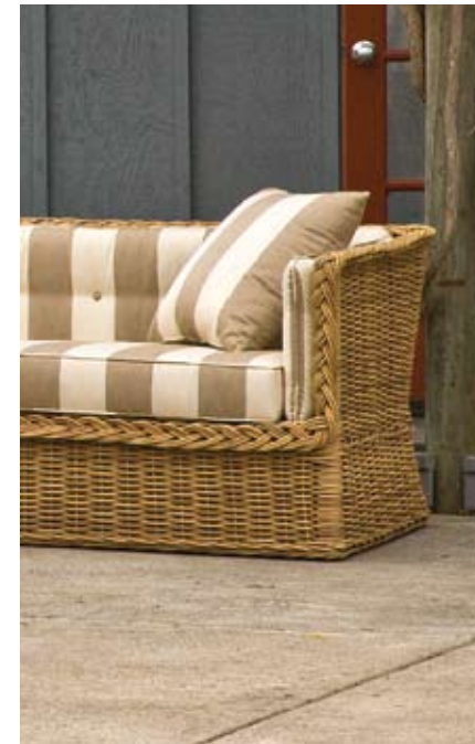
Daybed/Sofa, Natural resin