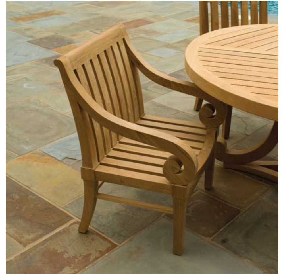
San Pietro Dining Arm and Side Chairs, Teak San Pietro Dining Arm Chair, Teak San Pietro Dining Table, Teak