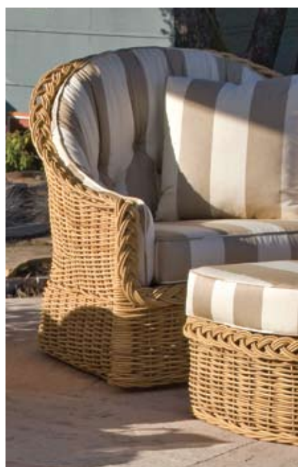
Large Scale Lounge Chair and Ottoman, Natural resin