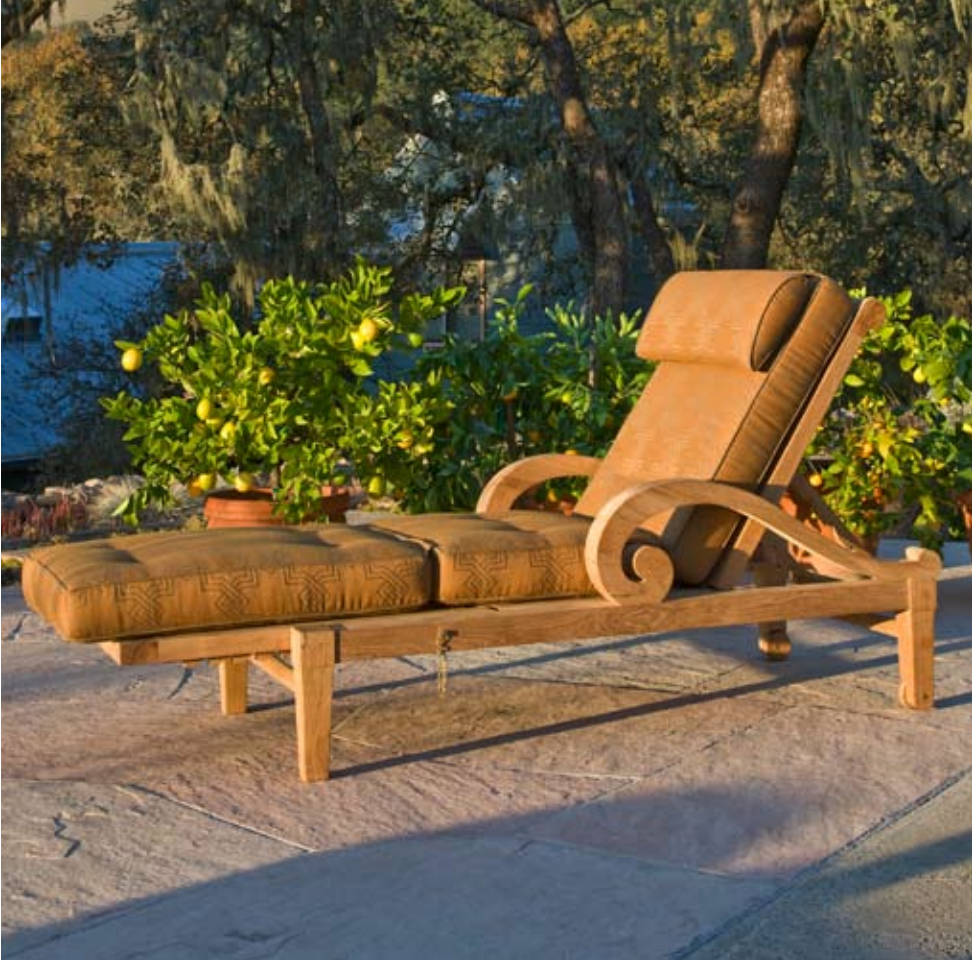
San Pietro Sun Chaise, Teak