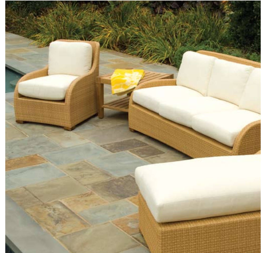
San Pietro Square End Table, Teak Brasilia Sofa, Flat Weave Natural resin Brasilia Chaise Lounge, Flat Weave Natural resin