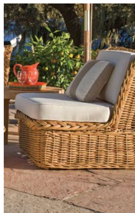
Armless Lounge Chair, Natural resin