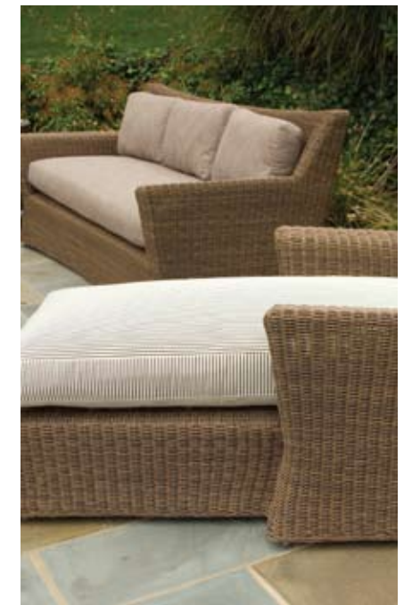
Belize Chaise, Belize Sofa, Coco resin